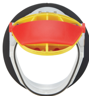
NRV100 for DN100 pipe inlets