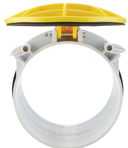
NRV150 for DN150 pipe inlets